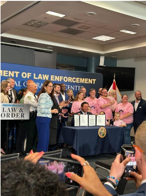
Signing of Bill HB 1159 Missy's law by Gov. Desantis